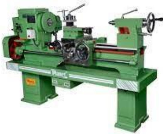
MEDIUM DUTY LATHE MACHINE