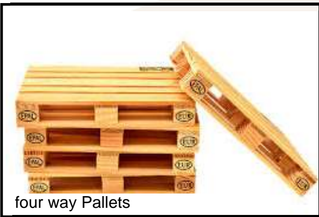
four way Pallets