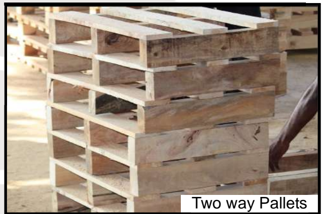
Two way Pallets