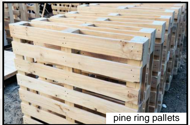
pine ring pallets