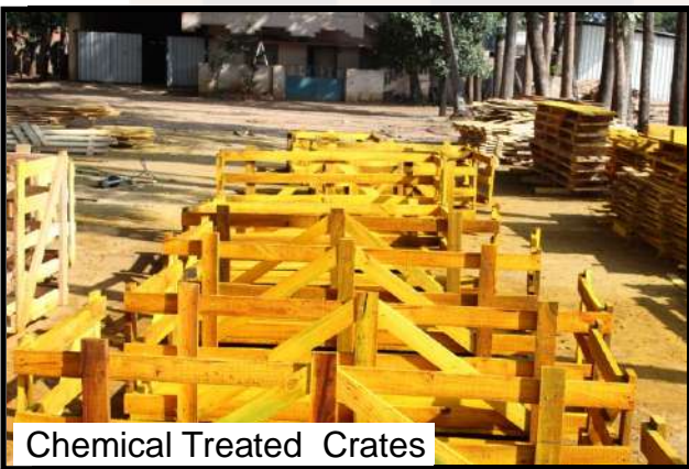
Chemical Treated Crates