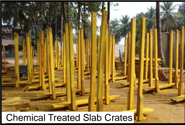
Chemical Treated Slab Crates