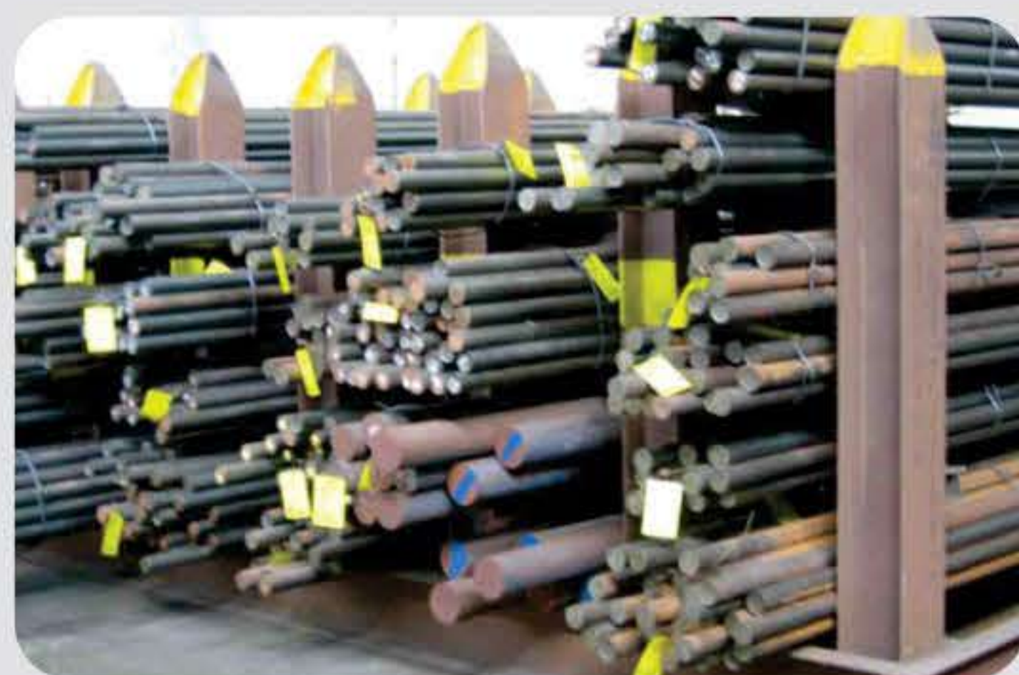
Raw Material Storage