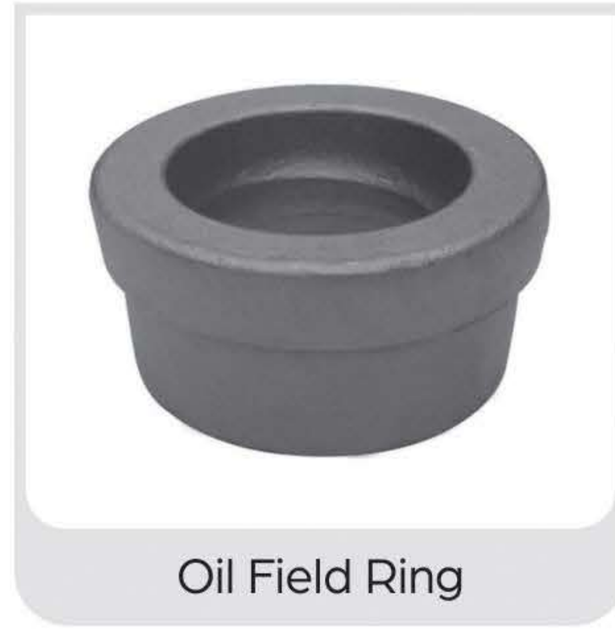
Oil Field Ring