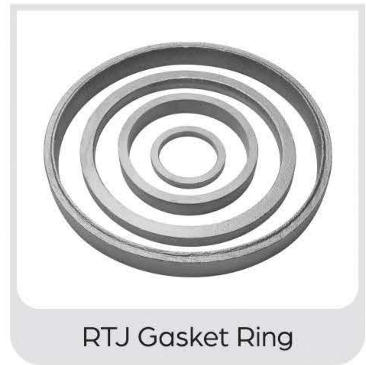
RTJ Gasket Ring