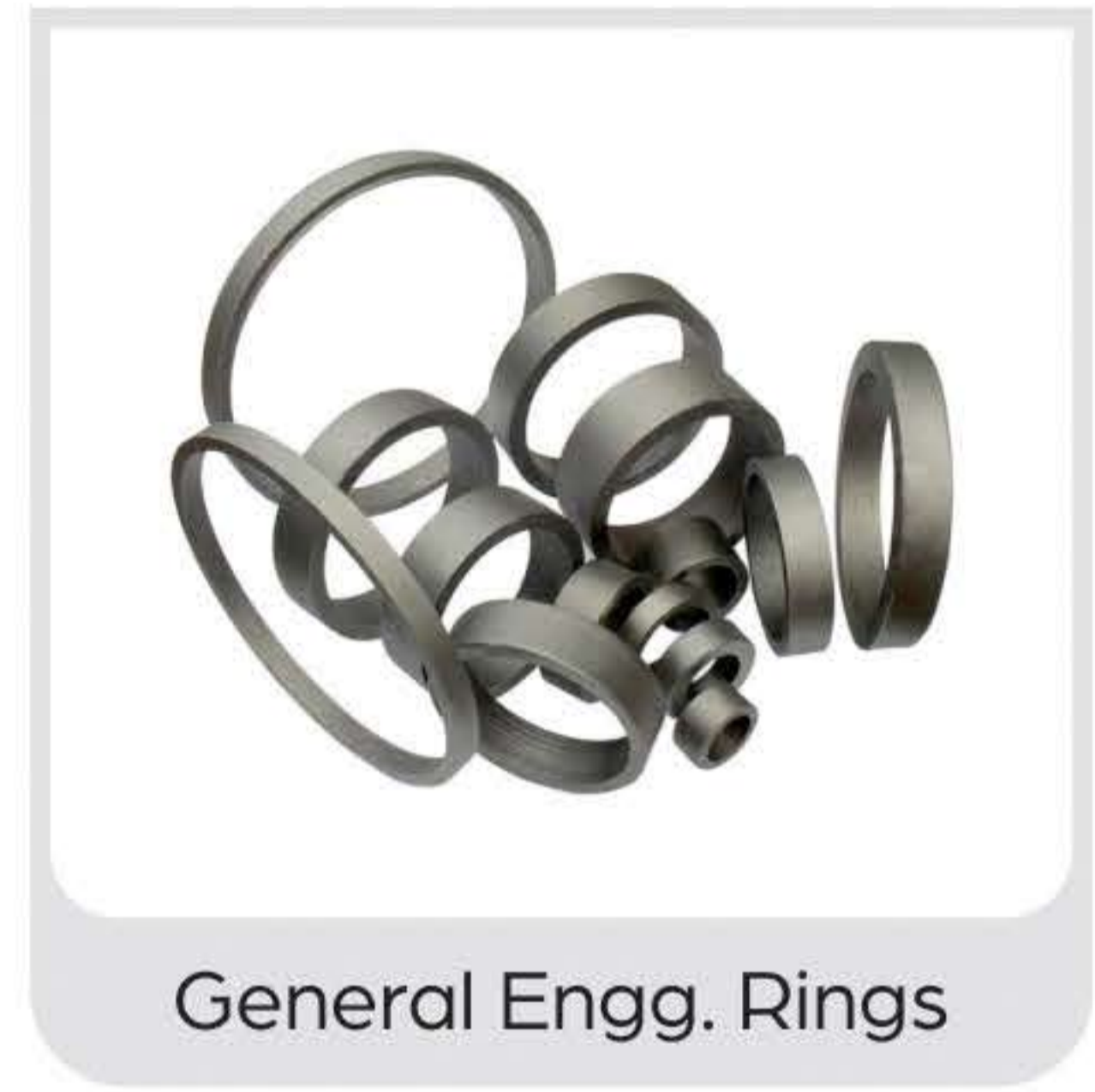
General Engg. Rings