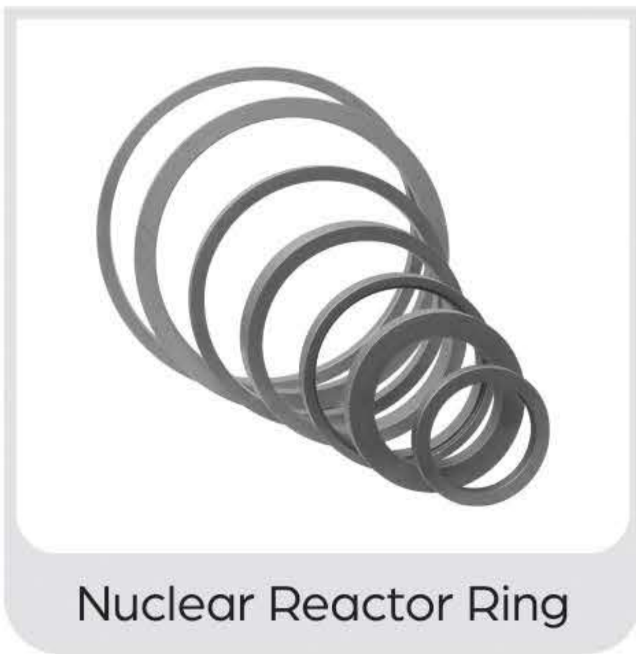
Nuclear Reactor Ring