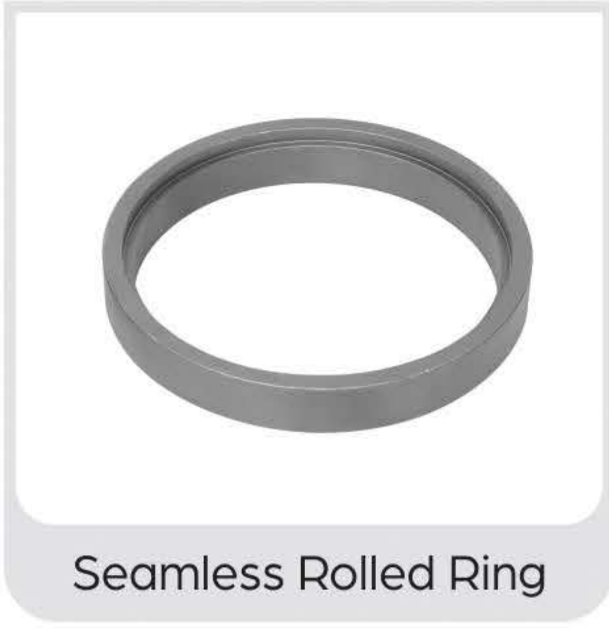
Seamless Rolled Ring