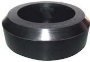
Packer Elements Nitrile Downhole