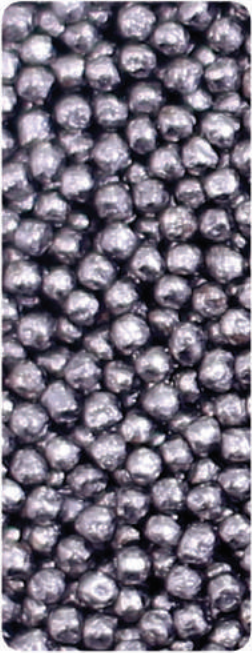
Stainless Steel Cut Wire Shot