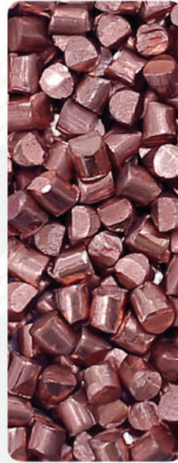
Copper Cut Wire Shot