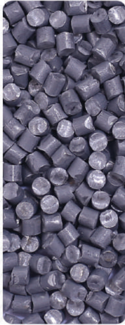
Carbon Steel Cut Wire Shot