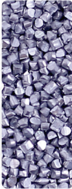
Aluminum Cut Wire Shot