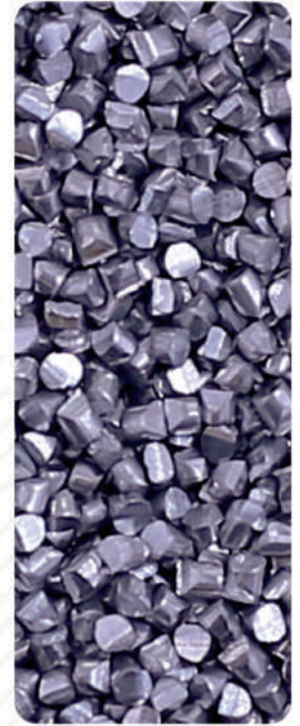
Zinc Cut Wire Shot