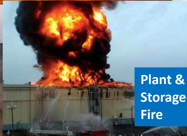
Plant & Storage Tank Fire