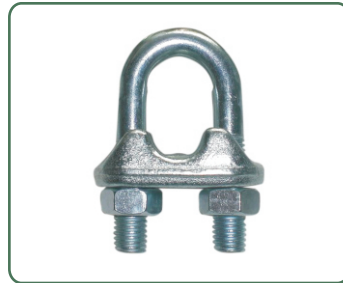
Wire Rope Clip