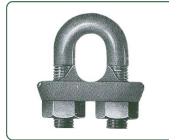
Bull Dog Grip